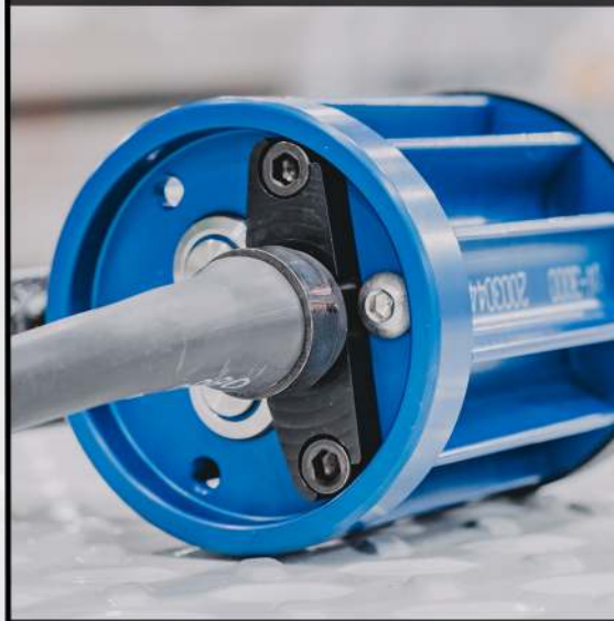
Power Cord Installed