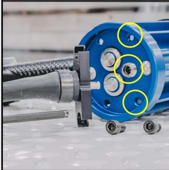
Step 2: Locate connection points