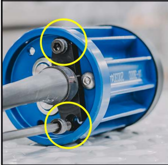
Step 4: Use screws to fasten to lamp body