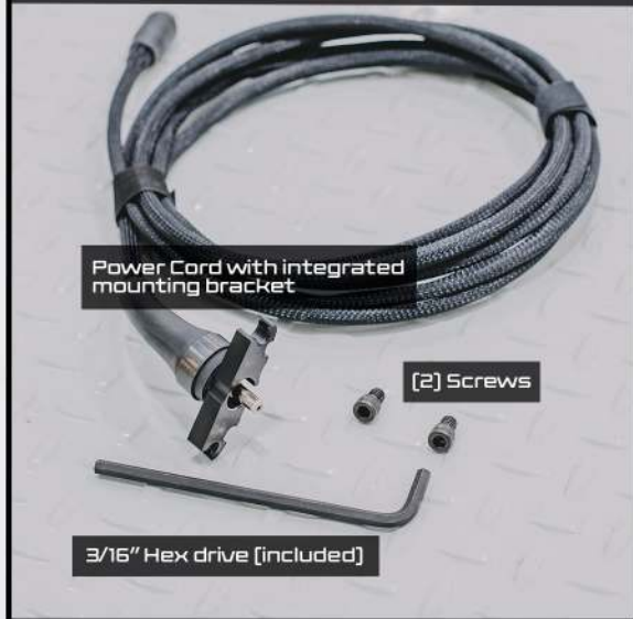
Step 1: Collect all required parts